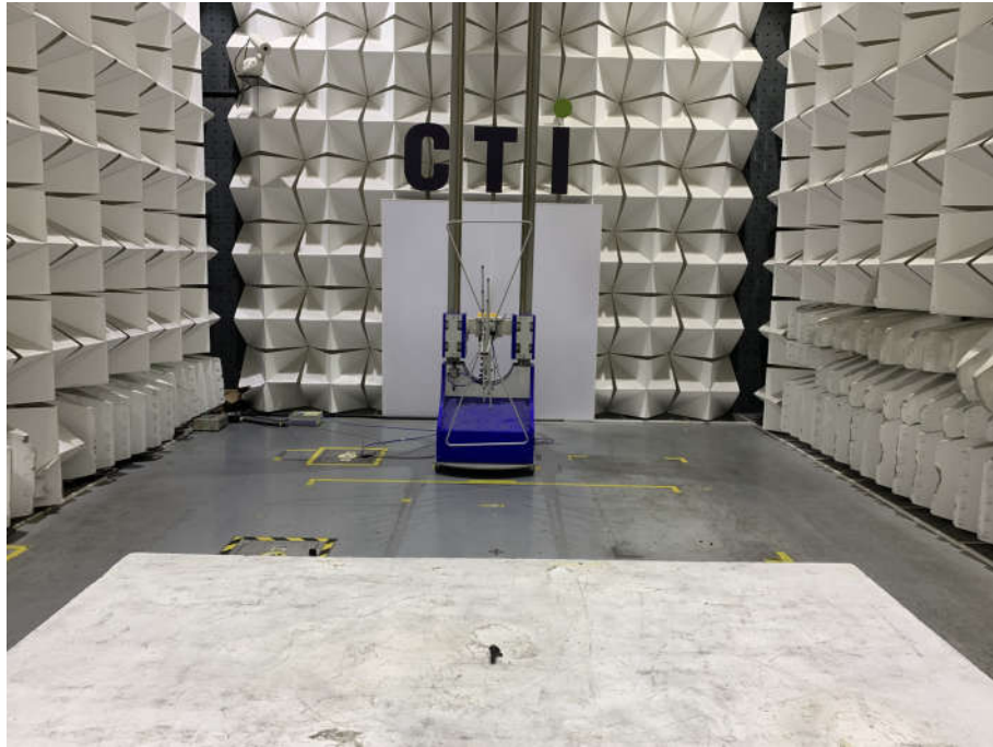
Radiated spurious emission Test Setup-1 right ear(Below 1GHz)