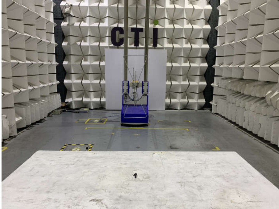
Radiated spurious emission Test Setup-1 left ear(Below 1GHz)