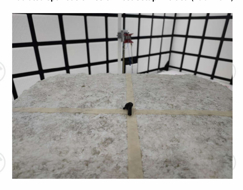
Radiated spurious emission Test Setup-2 left ear(Above 1GHz)