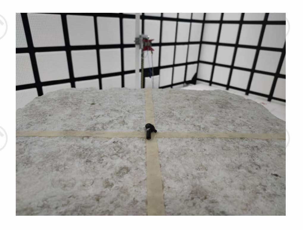
Radiated spurious emission Test Setup-2 right ear(Above 1GHz)