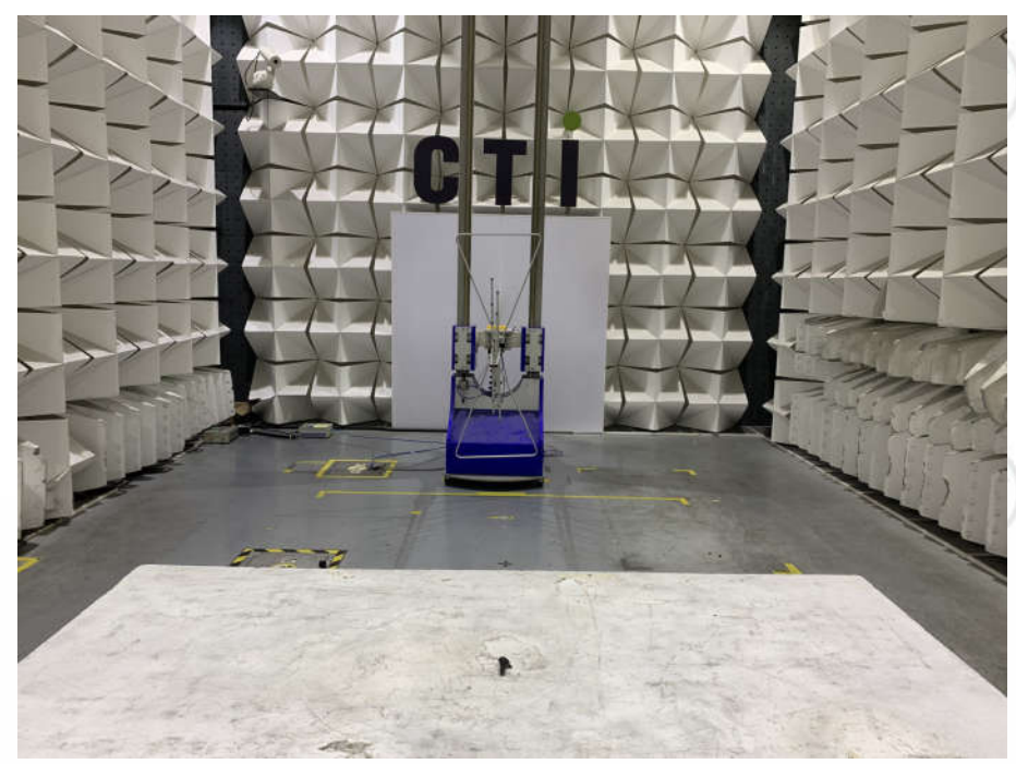
Radiated spurious emission Test Setup-1 right ear(Below 1GHz)

Page 33 of 57 Report No.: EED32P80349001