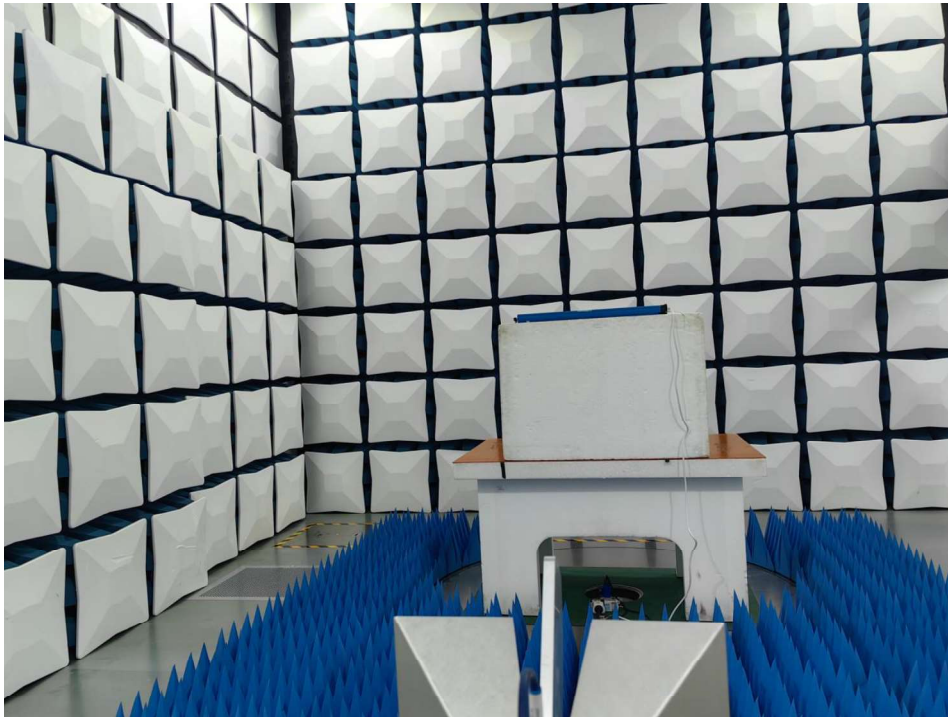
Test Set-up: Radiated spurious emission 1GHz-18GHz