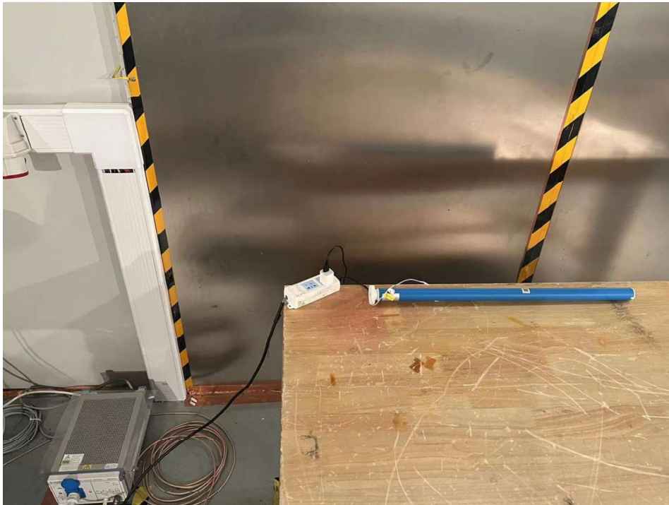
Test Set-up: Conducted emission 150KHz-30MHz