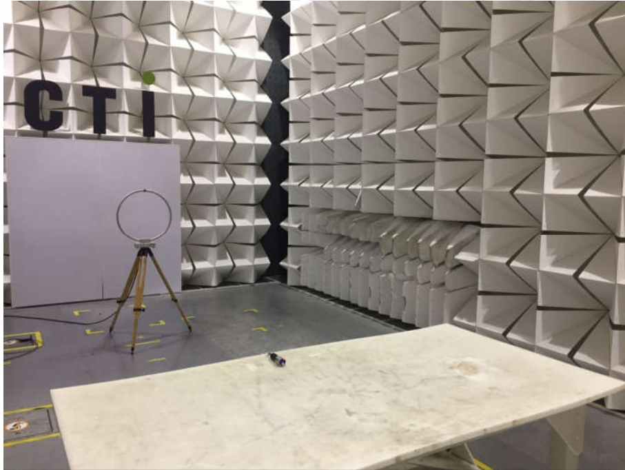
Radiated spurious emission Test Setup-1(Below 30MHz)