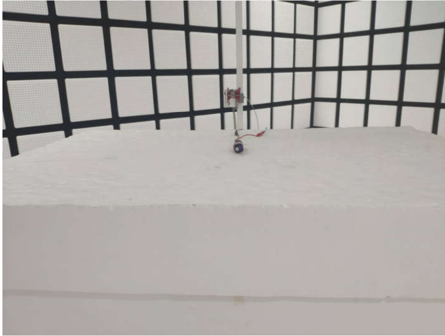
Radiated spurious emission Test Setup-3(Above 1GHz)