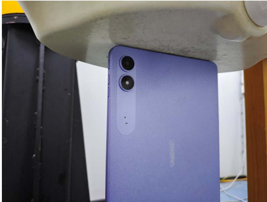
Body Bottom Setup Photo (0mm)