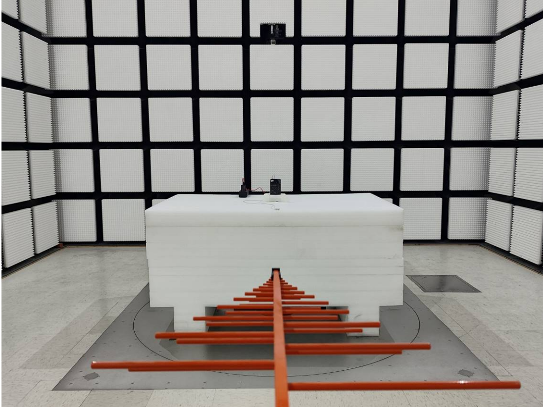
Radiated Emission Below 1GHz View -Model:G2 +Adapter 2#