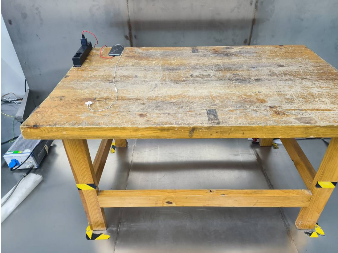
Conducted Emissions Side View-Model:G2+Adapter 1#