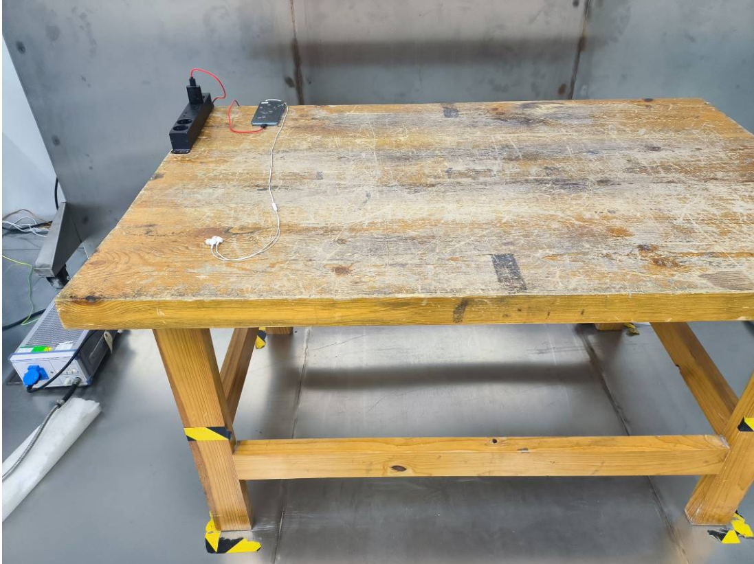
Conducted Emissions Side View-Model:G2+Adapter 2#