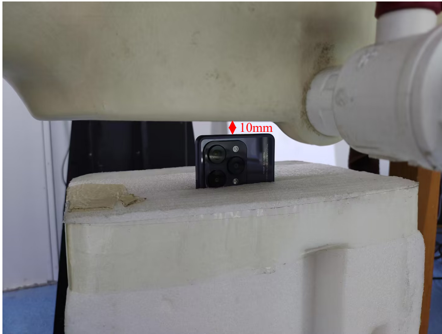
Body Bottom Setup Photo (10mm)