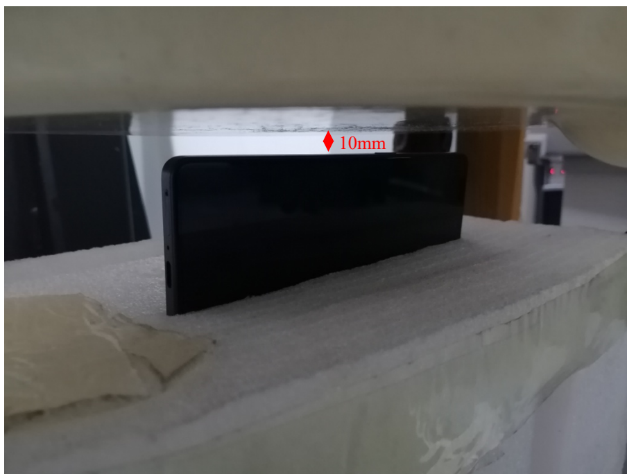
Body Right Setup Photo (10mm)