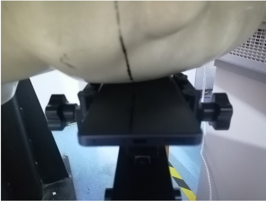
Head Left Tilt Setup Photo (0mm)