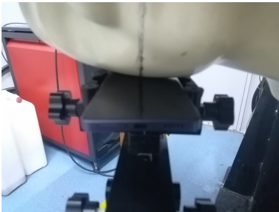
Head Right Tilt Setup Photo (0mm)