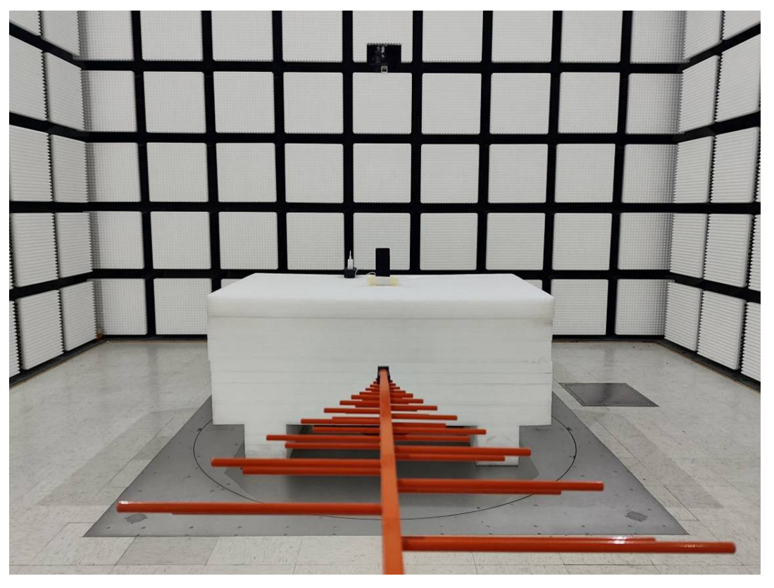
Radiated Emission Below 1GHz View