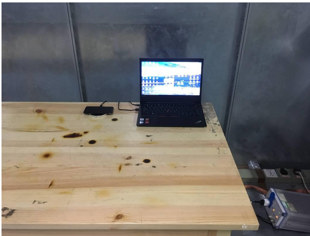
Conducted Emission-PC charge mode