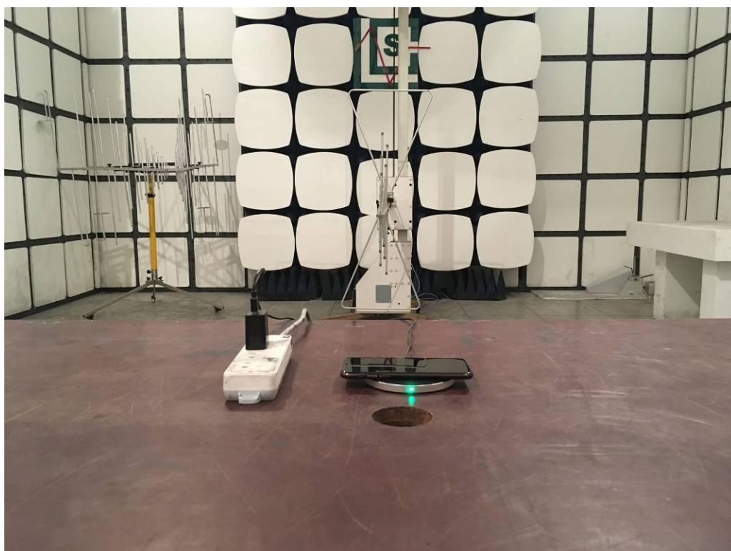
Radiated Emission below 1GHz-AC adapter charge mode