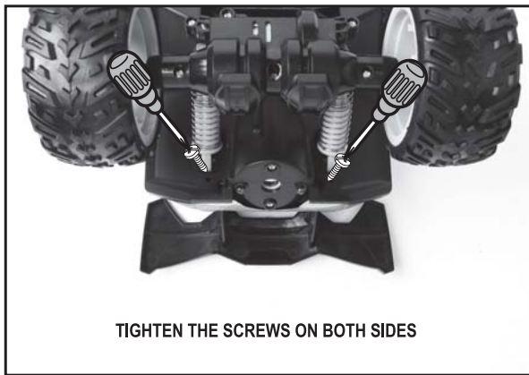
TIGHTEN THE SCREWS ON BOTH SIDES