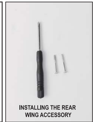
INSTALLING THE REAR WING ACCESSORY