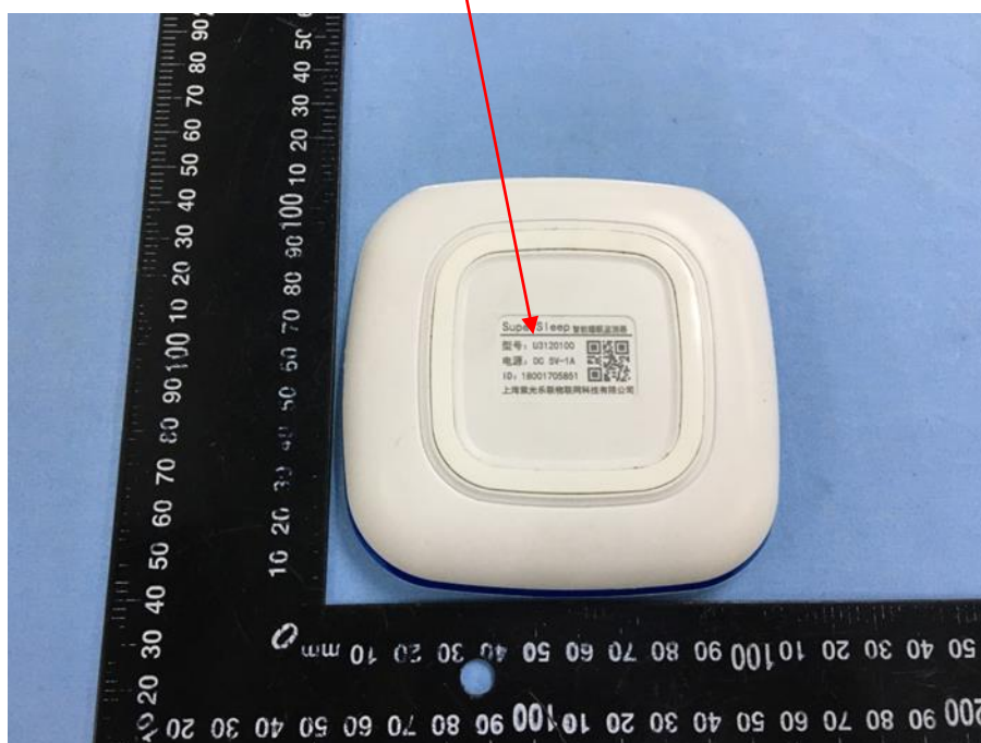
IC Label Location