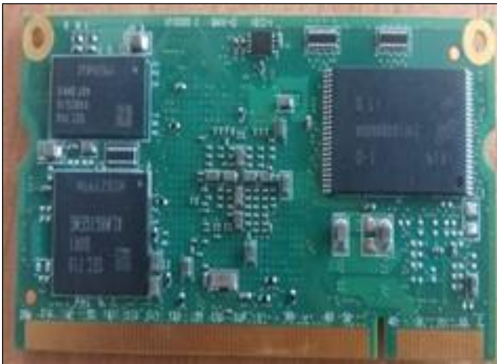
SOM PCB Board Bottom View