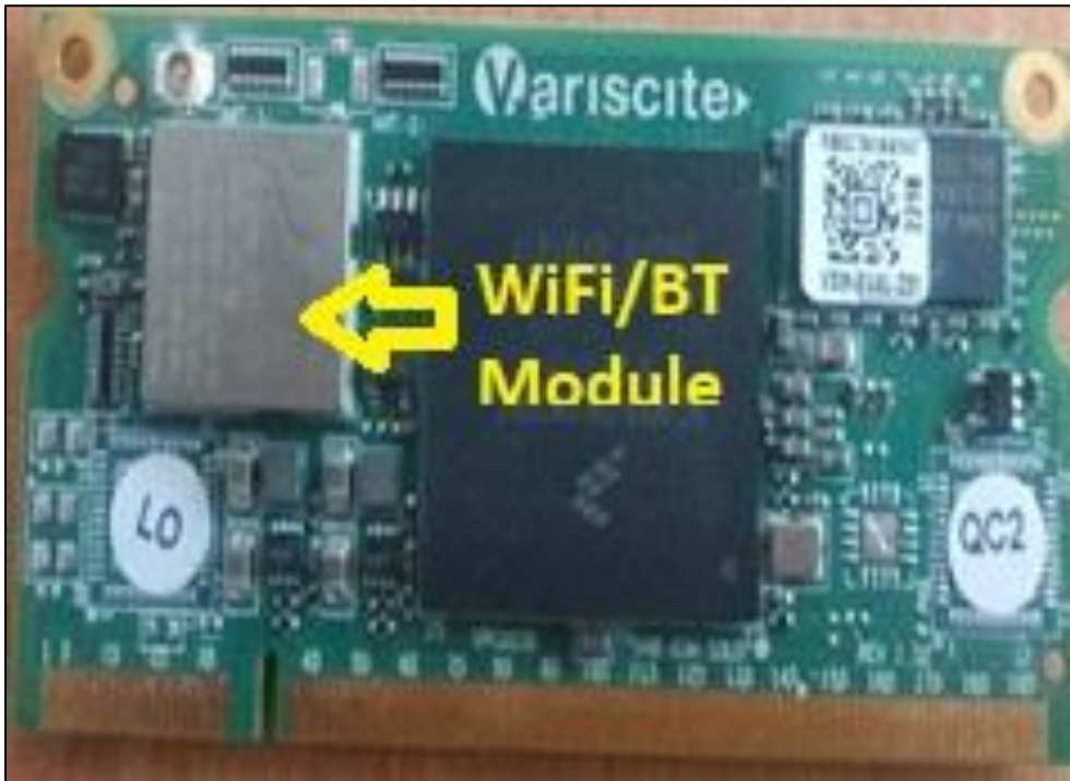
SOM PCB Board Top View