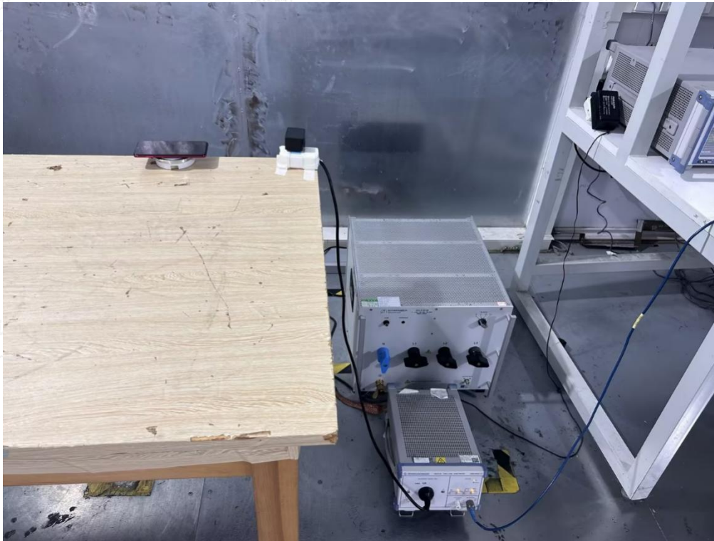
Conducted Emission -AC adapter charge mode