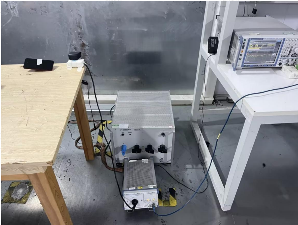
Conducted Emission -AC adapter charge mode