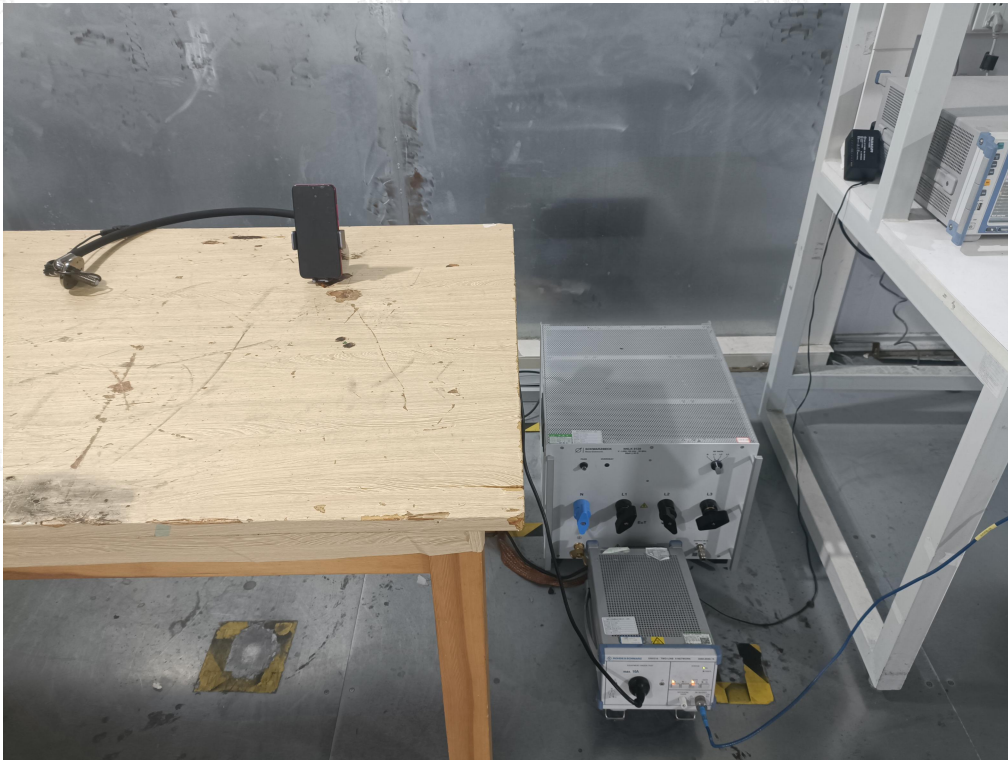
Conducted Emission-AC adapter charge mode