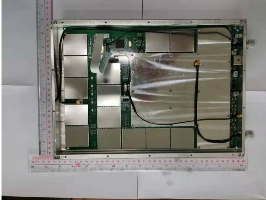
EUT – PCB Top View