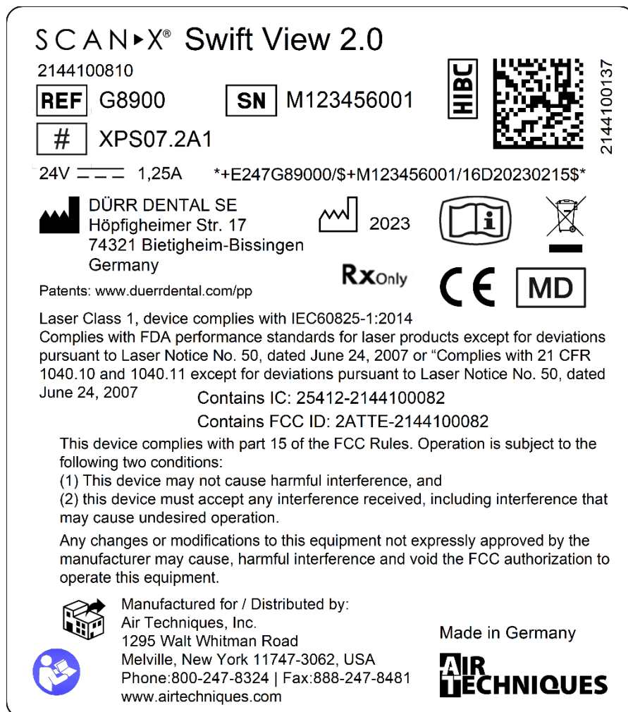
Figure 1: Example label from one device variant

The RFID Modul 2144100082 will be used as a module e.g. in Intraoral Plate Scanners. An example host label from one device variant is shown in Figure 1 below: