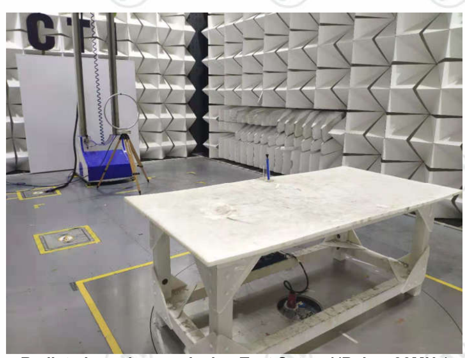
Radiated spurious emission Test Setup-1(Below 30MHz)