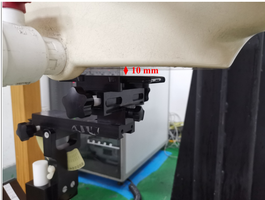
Body (Worn) Front Setup Photo (10mm)