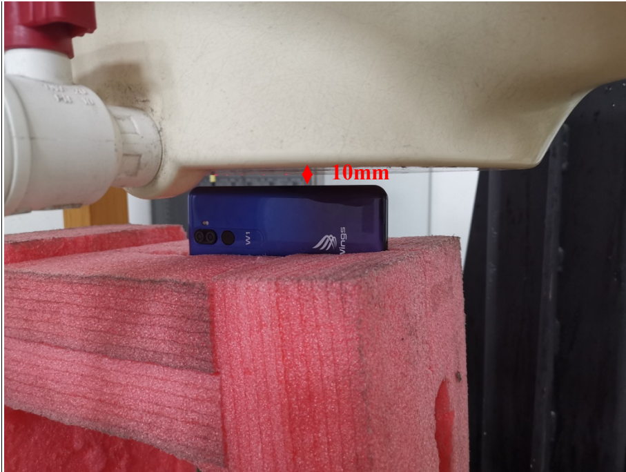
Body Right Setup Photo (10mm)