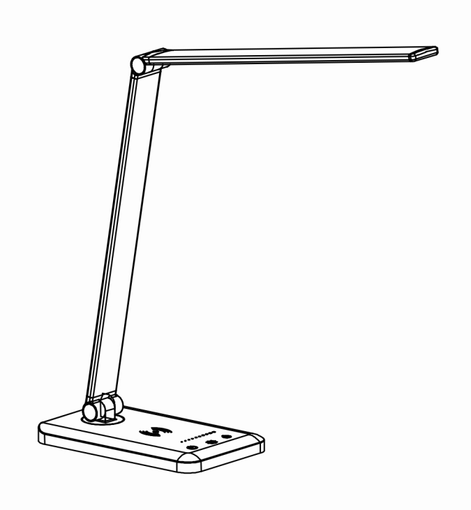
Dear customer, thank you for using our lamp

In order to facilitate your use of this product, please read the instructions carefully before using.