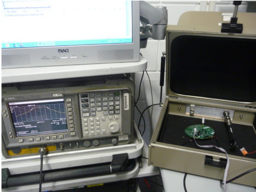
Photograph No.1 Setup for OBW measurements