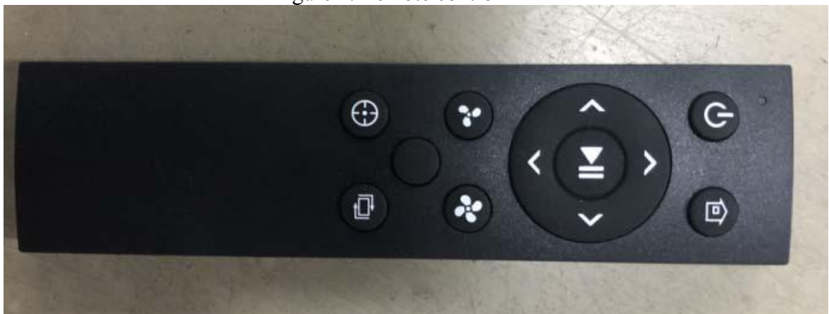
Figure 5. Remote control 3