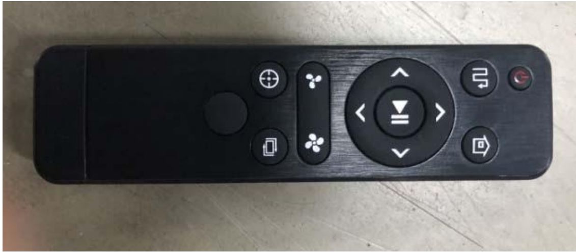
Figure 3. Remote control 1