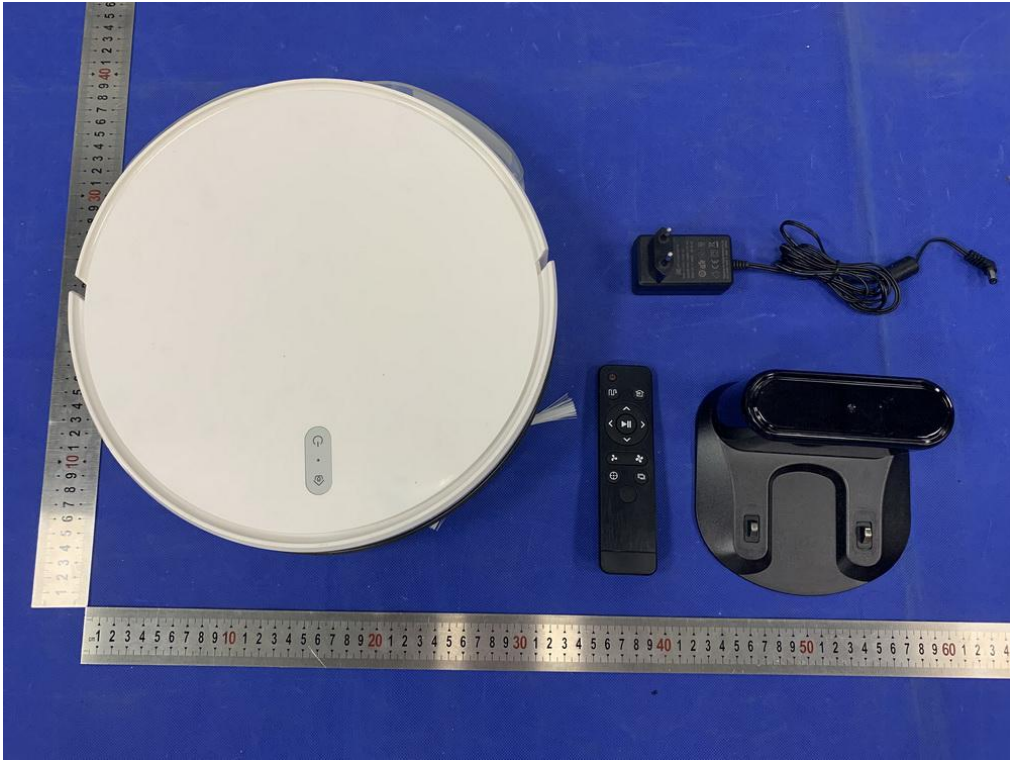
Figure 1. Overall view of unit