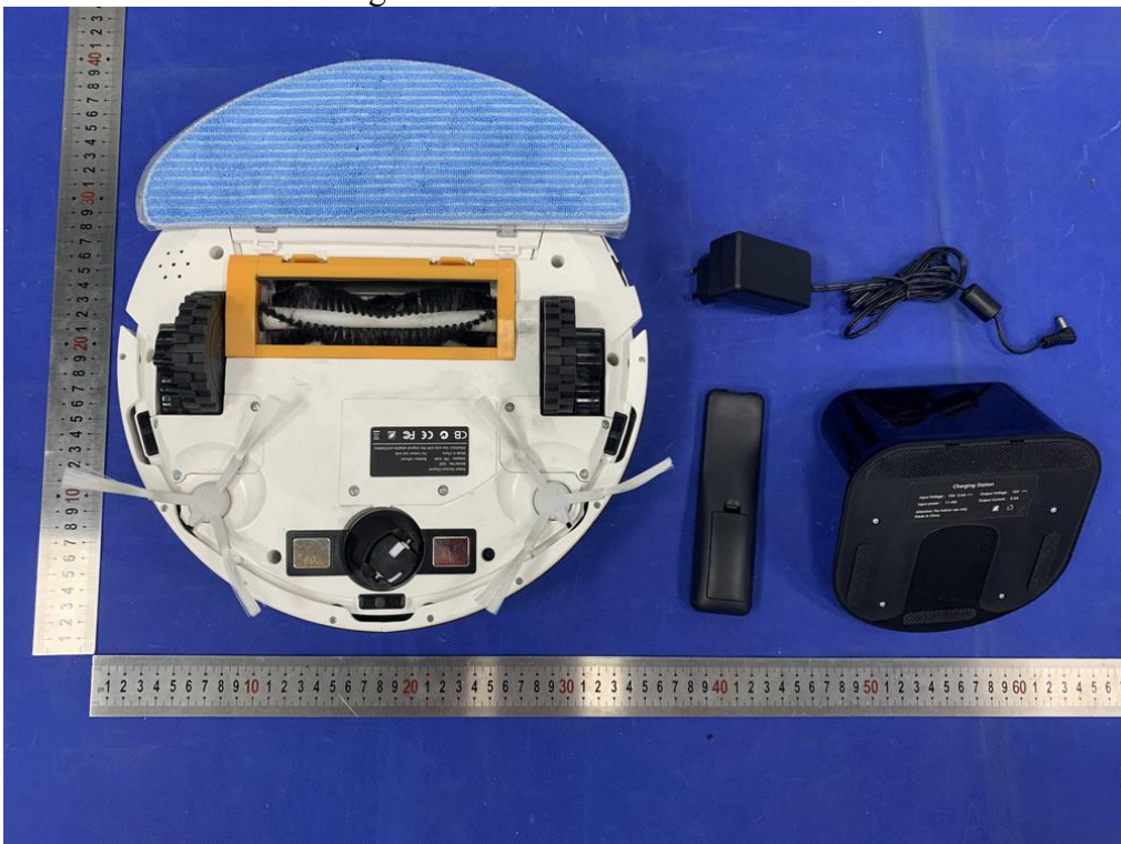
Figure 2. Overall view of unit