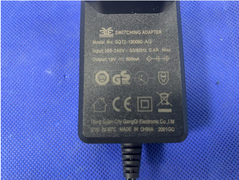
Figure 8. Label view of adapter