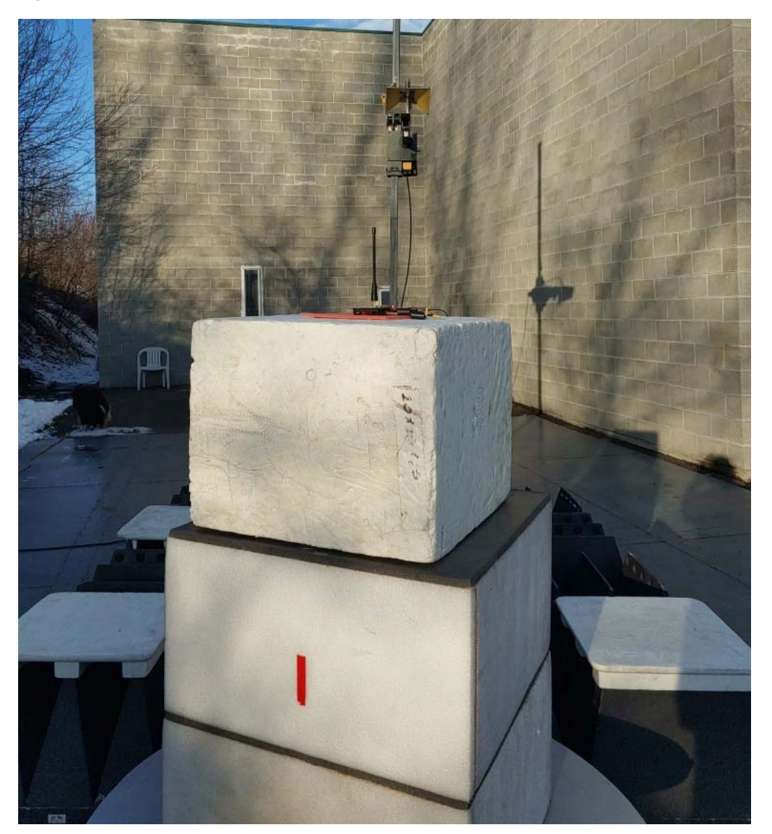
Figure E21.5 – Test Set Up - Radiated Measurements 1 – 4GHz, Antenna #1