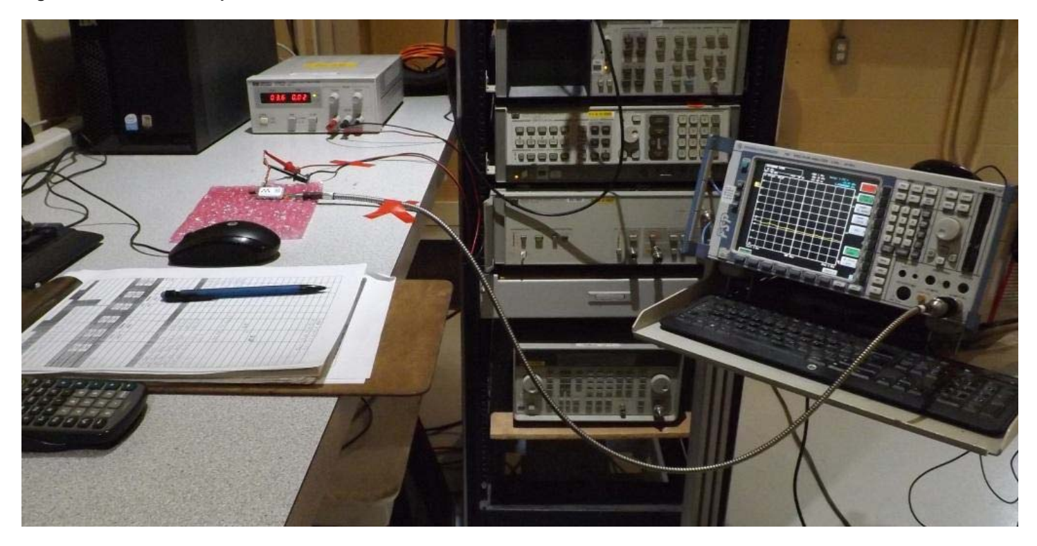
Figure E21.1 – Test Set Up - Conducted Measurements