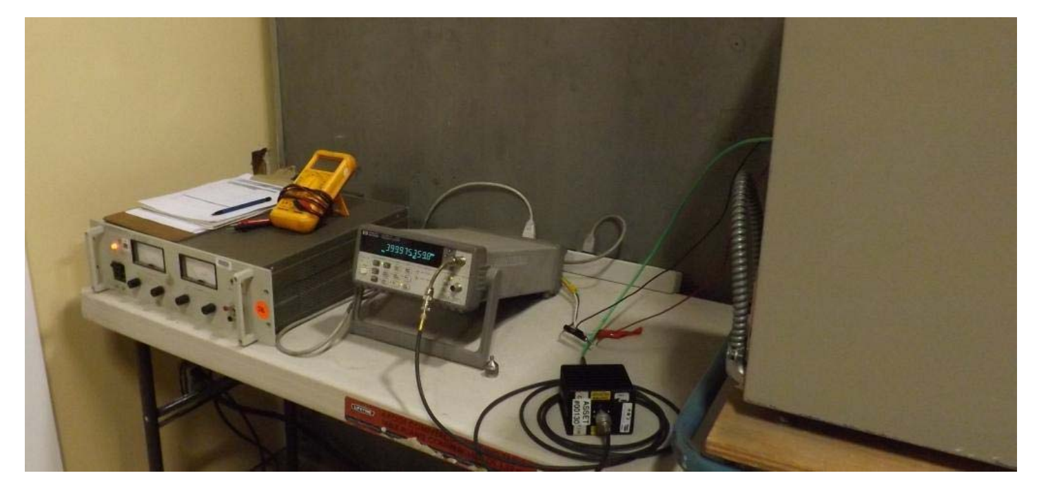
Figure E21.7 – Test Set Up - Frequency Stability

Applicant:Myriota Pty Ltd / Myriota CanadaFCC ID:2ATKL-M2-24Test Report S/N:45461648-R2.0ISED ID25148-M224