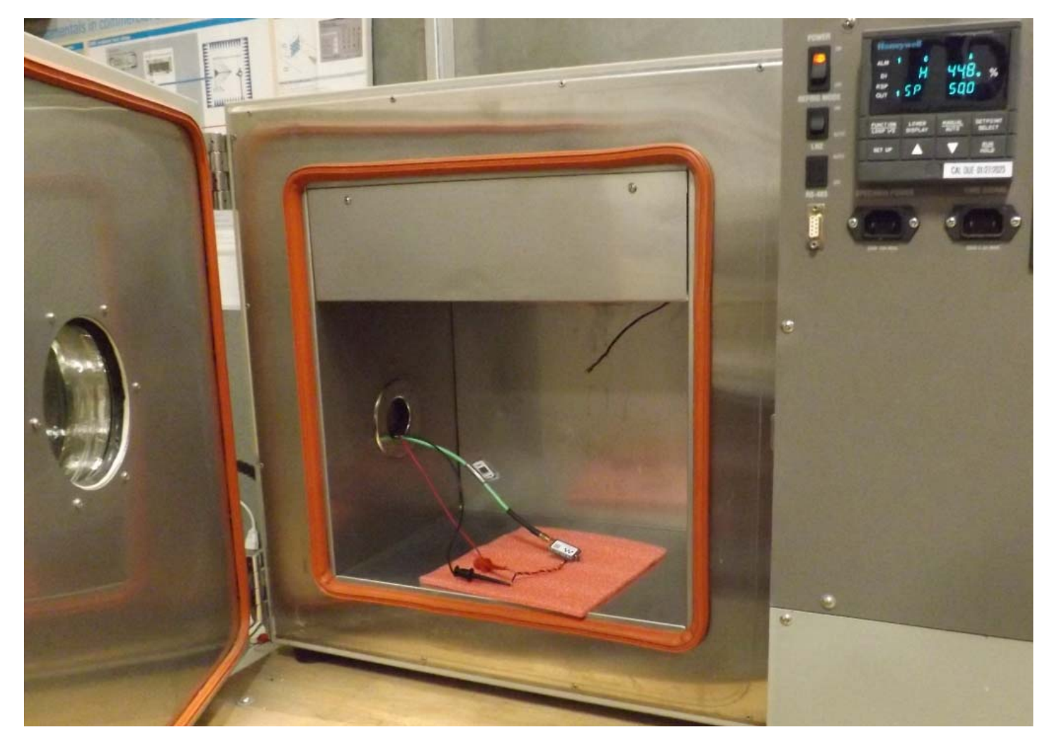
Figure E21.8 – Test Set Up - Frequency Stability

Applicant:Myriota Pty Ltd / Myriota CanadaFCC ID:2ATKL-M2-24Test Report S/N:45461648-R2.0ISED ID25148-M224