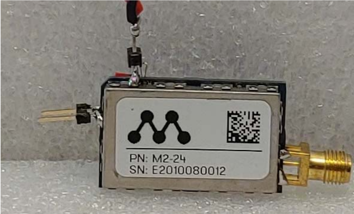
Figure E19.1 – External – Module Top