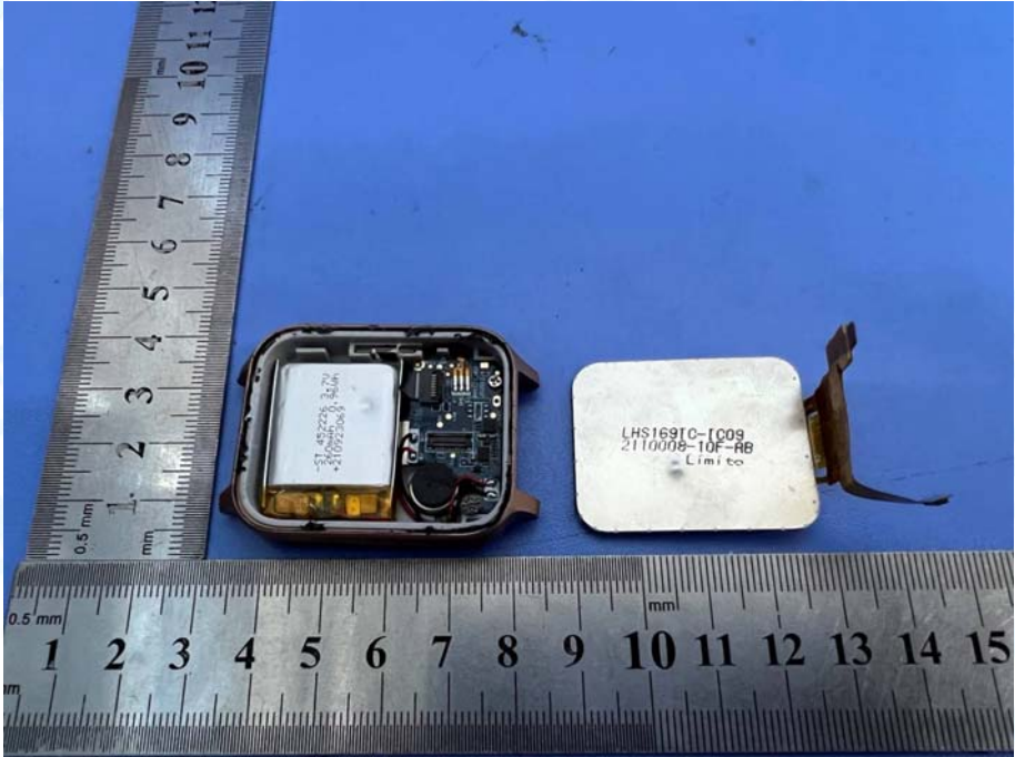
Photo 8 Appearance of PCB