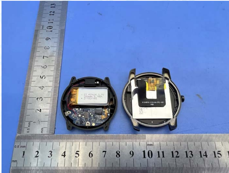
Photo 7 Appearance of PCB