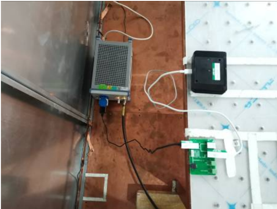
Conducted Emissions Test Setup (with charger)