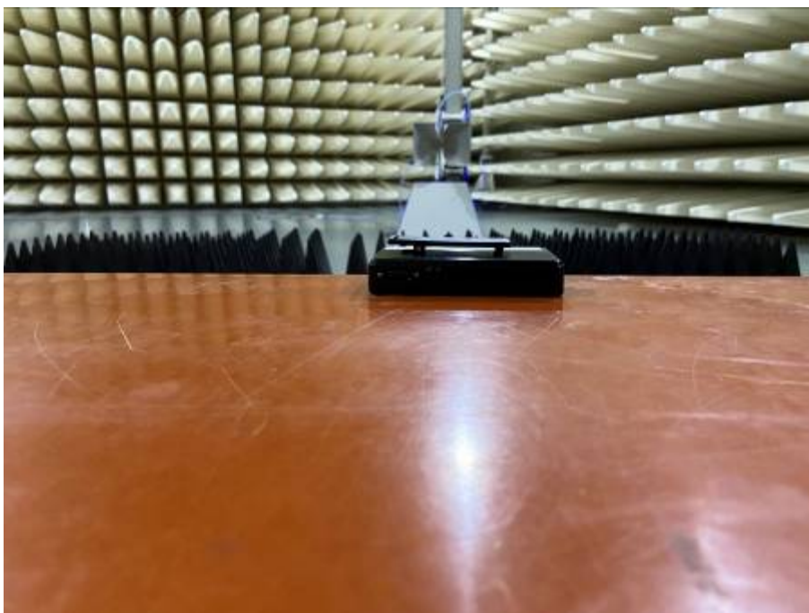
Radiated Emissions Test Setup (with charger) (above1GHz)