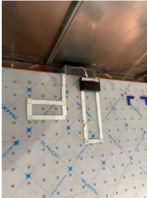
Conducted Emissions Test Setup (with charger)