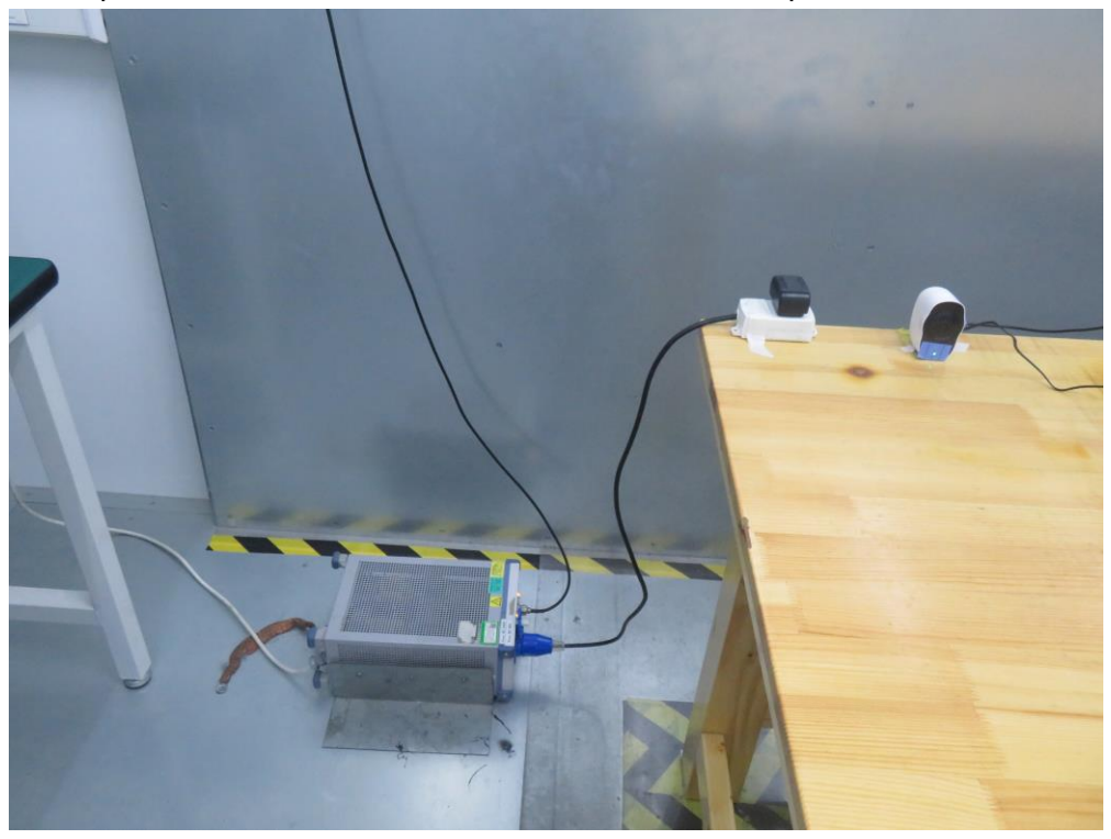
Description: Back View Conducted Emission Test Setup for Power Port