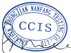
Bruce Zhang Laboratory Manager

This report details the results of the testing carried out on one sample. The results contained in this test report do not relate to other samples of the same product and does not permit the use of the CCIS product certification mark. The manufacturer should ensure that all products in series production are in conformity with the product sample detailed in this report.