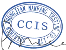
Bruce Zhang Laboratory Manager

This report details the results of the testing carried out on one sample. The results contained in this test report do not relate to other samples of the same product and does not permit the use of the CCIS product certification mark. The manufacturer should ensure that all products in series production are in conformity with the product sample detailed in this report.