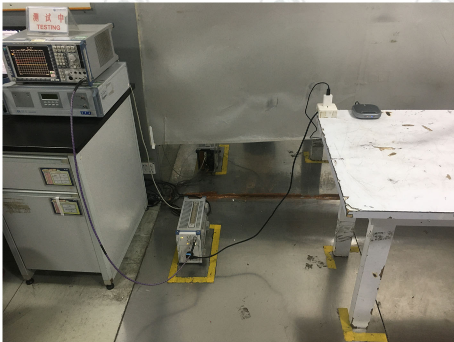
Radiated spurious emission Test Setup-2(CE)