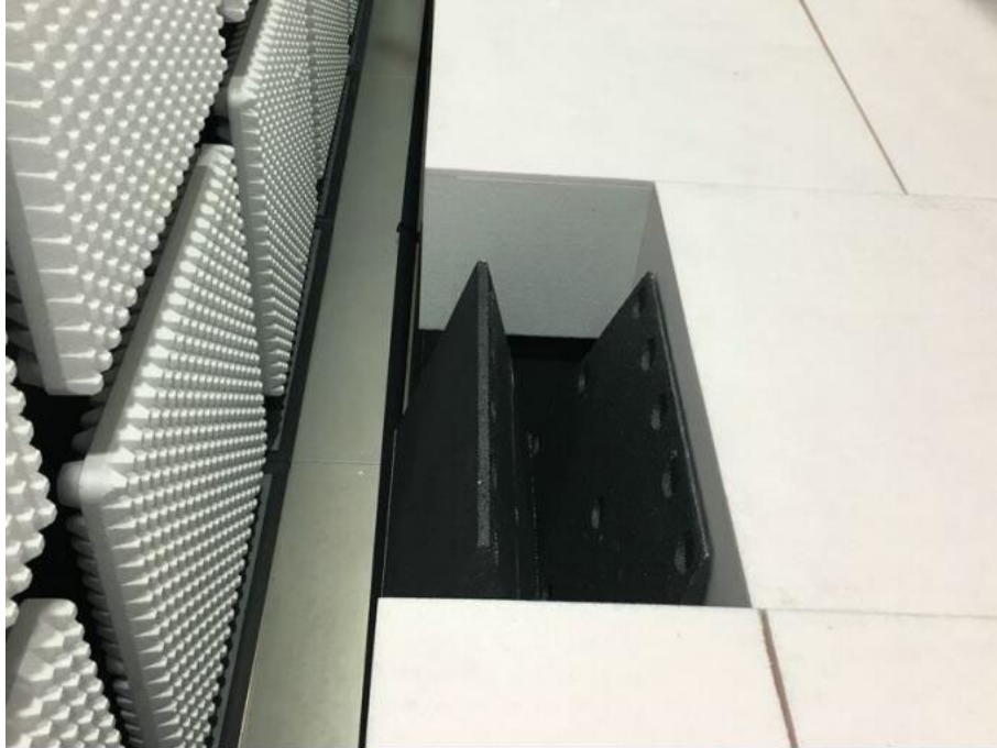
Radiated spurious emission Test Setup-3(Above 1GHz) There are absorbing materials under the ground.