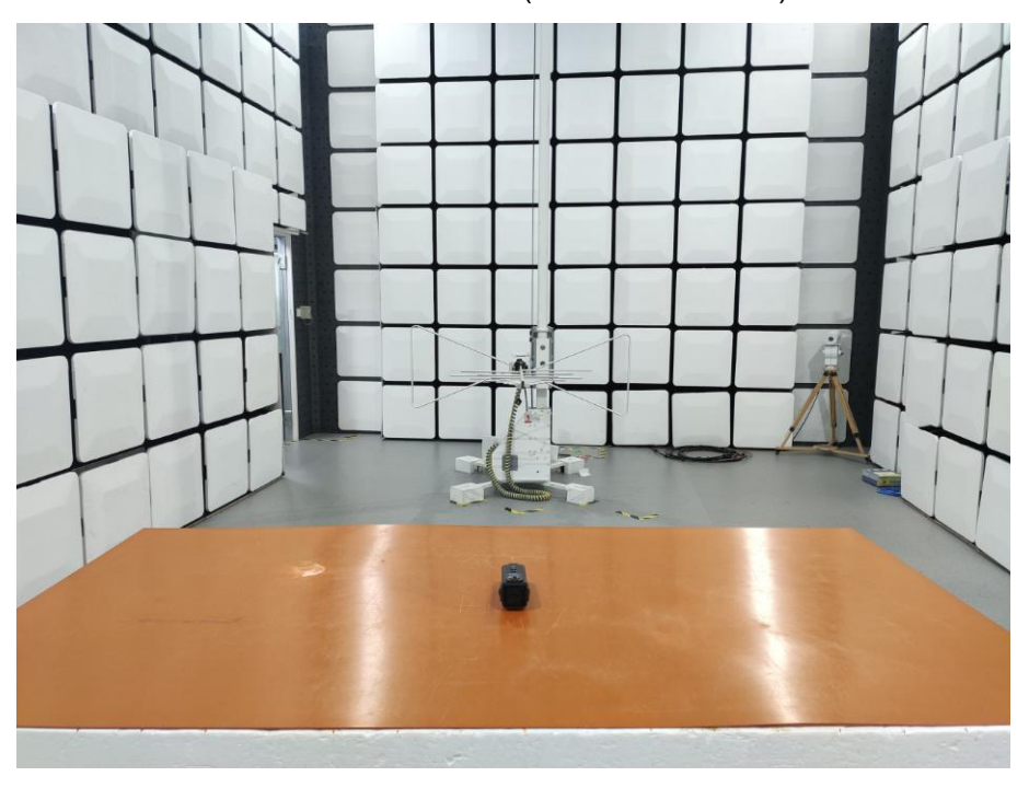
Radiated Emissions (Above 1GHz)