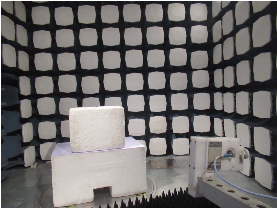
18GHz - 26.5GHz