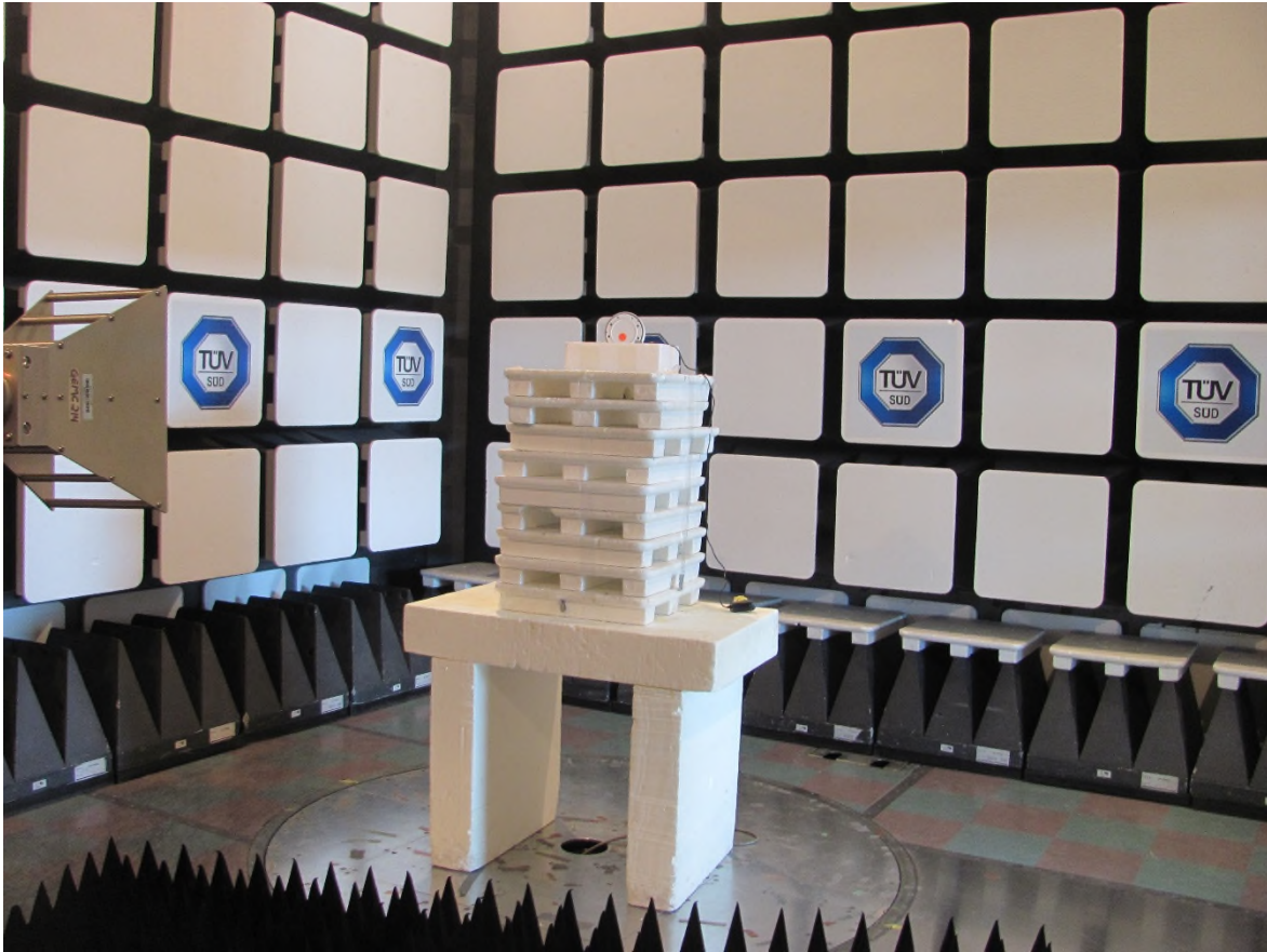
Figure 3 – Radiated Emissions Setup – Photo 3

Note: As per ANSI C63.10-2013 Clause 6.3.1, above 1GHz, the height of the EUT was set to 1.5m.