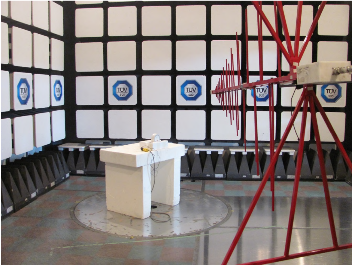
Figure 2 – Radiated Emissions Setup – Photo 2

Note: As per ANSI C63.10-2013 Clause 6.3.1, below 1GHz, the height of the EUT was set to 80cm. Above 1GHz, the height was raised to 1.5m.