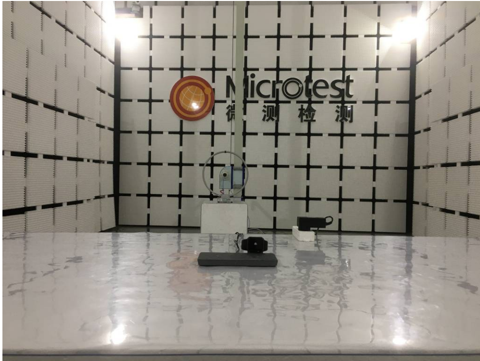
Radiated emission(Watch : 30MHz-1GHz)