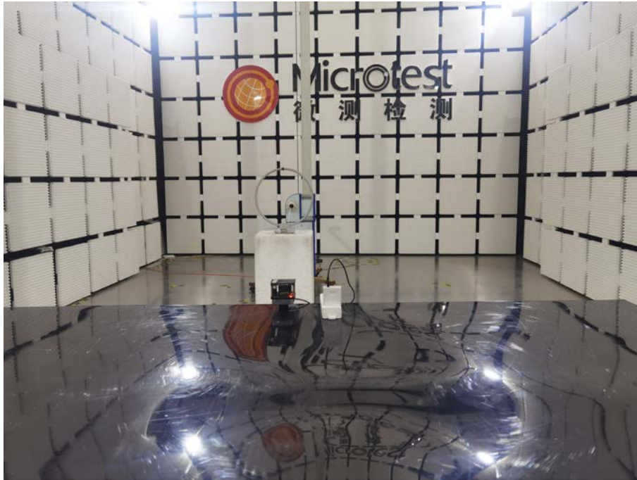
Radiated emissions –Below 1 GHz