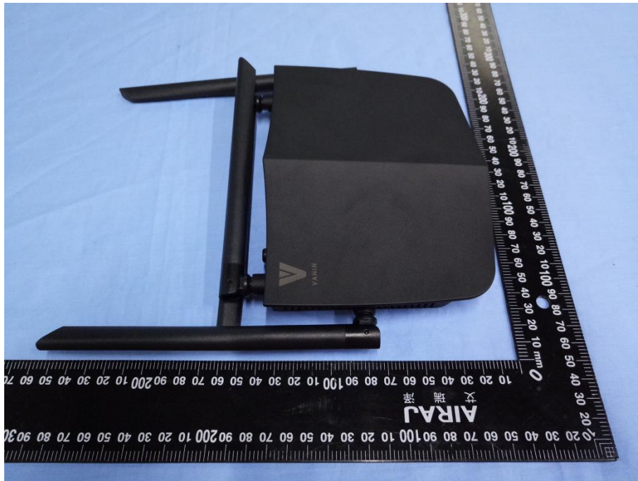
EUT left side view

NOTE: 1.The report is invalid when there is no the approver signature and the special stamp for test report. 2.The test report shall not be reproduced except in full without prior written permission of the company. 3.The report copy is invalid when there is no the special stamp for test report. 4.The altered report is invalid. 5.The entrust test is responsibility for the received sample only.