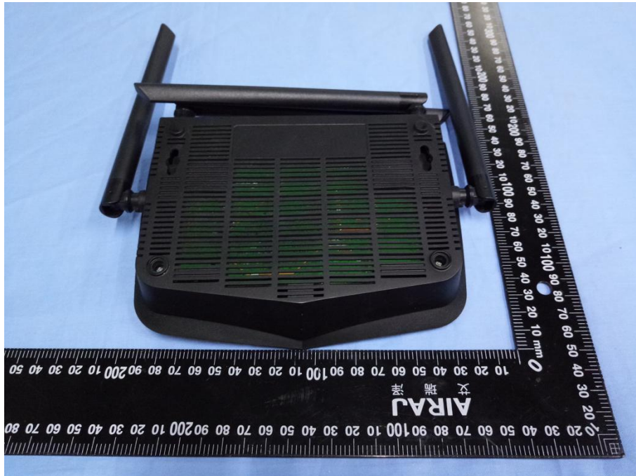
EUT rear view