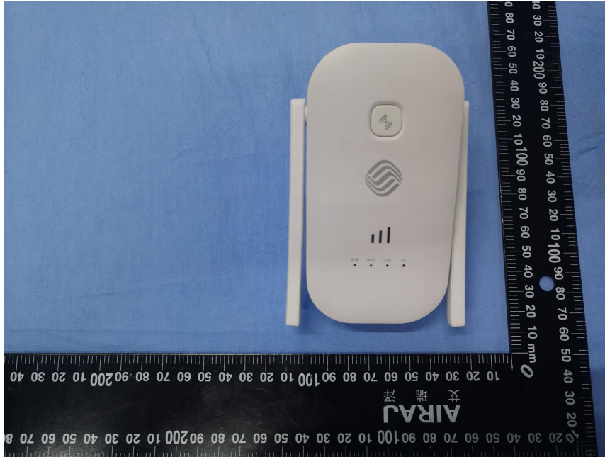
EUT front view