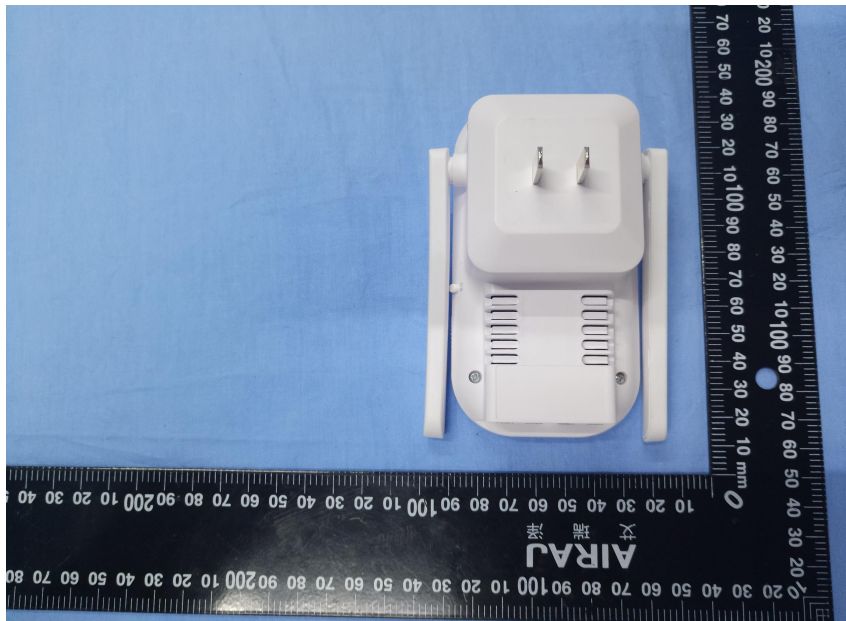
EUT rear view

NOTE: 1.The report is invalid when there is no the approver signature and the special stamp for test report. 2.The test report shall not be reproduced except in full without prior written permission of the company. 3.The report copy is invalid when there is no the special stamp for test report. 4.The altered report is invalid. 5.The entrust test is responsibility for the received sample only.