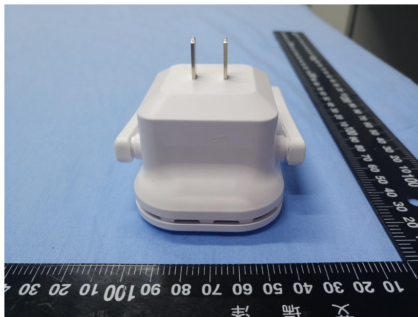
EUT top side view

NOTE: 1.The report is invalid when there is no the approver signature and the special stamp for test report. 2.The test report shall not be reproduced except in full without prior written permission of the company. 3.The report copy is invalid when there is no the special stamp for test report. 4.The altered report is invalid. 5.The entrust test is responsibility for the received sample only.