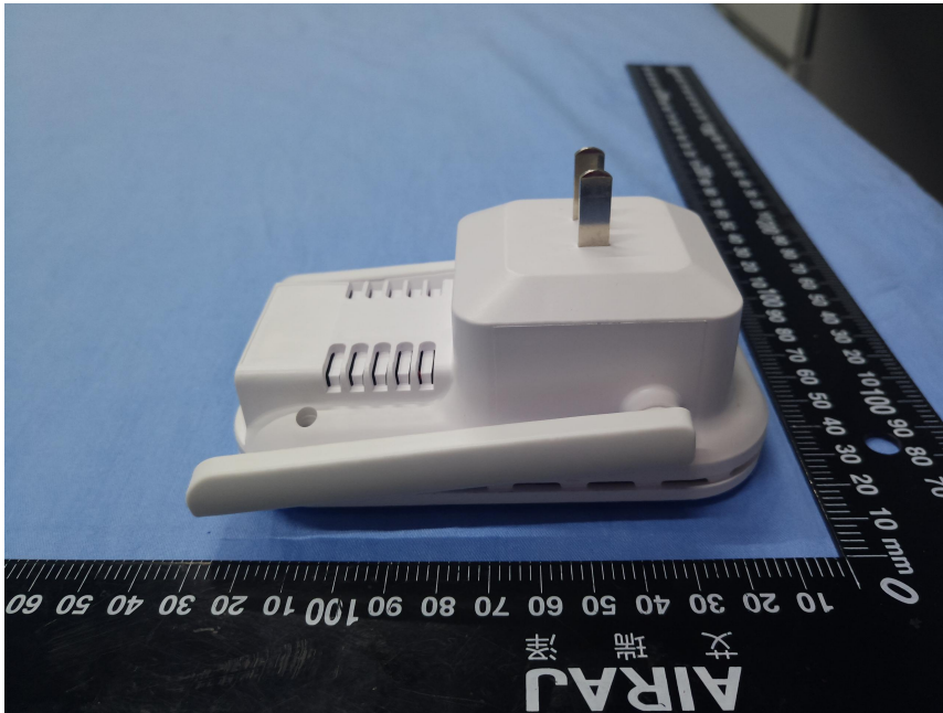
EUT left side view