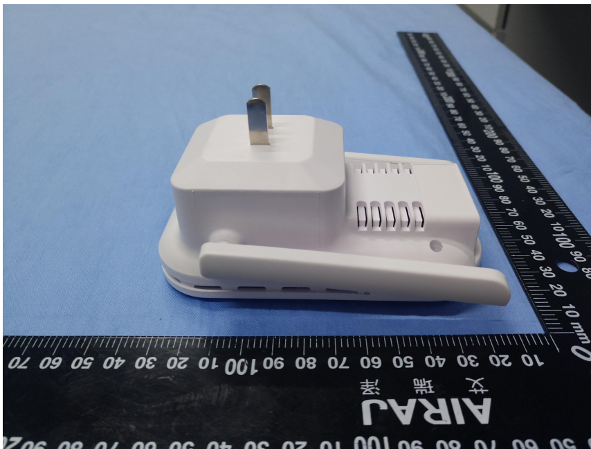
EUT right side view

NOTE: 1.The report is invalid when there is no the approver signature and the special stamp for test report. 2.The test report shall not be reproduced except in full without prior written permission of the company. 3.The report copy is invalid when there is no the special stamp for test report. 4.The altered report is invalid. 5.The entrust test is responsibility for the received sample only.