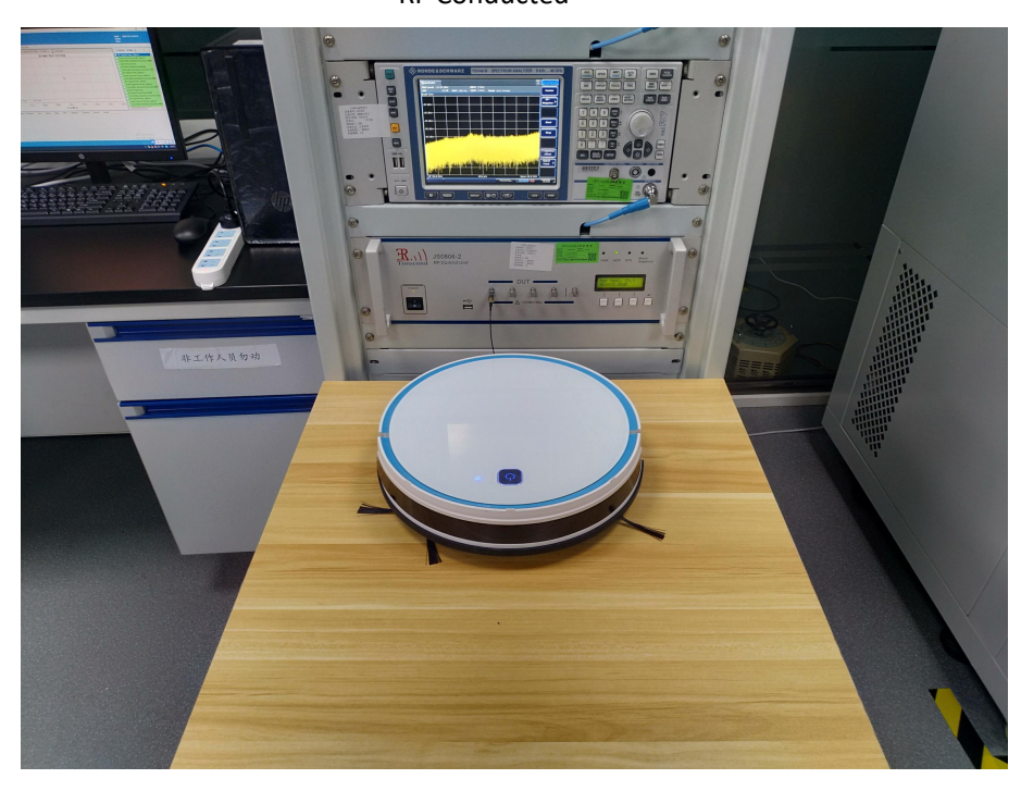
Conducted Emission For AC Mains Power Ports