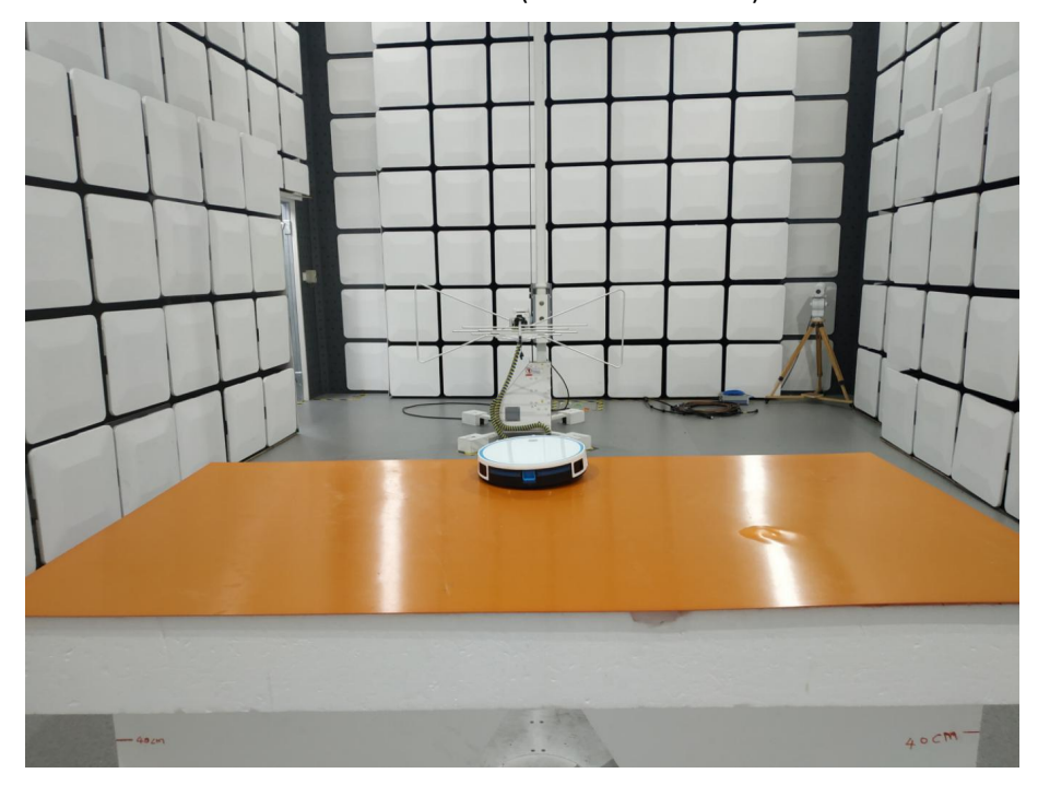
Radiated Emissions (Above 1G)