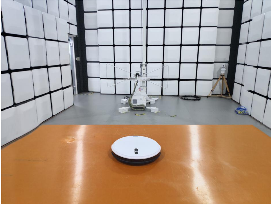
Radiated Emissions (Above 1GHz)