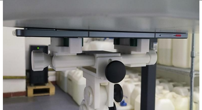
Back Side (Separation distance of 0mm)