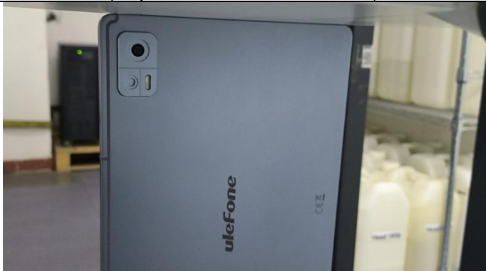
Left Side (Separation distance of 0mm)