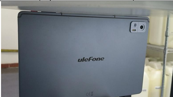
Top Side (Separation distance of 0mm)