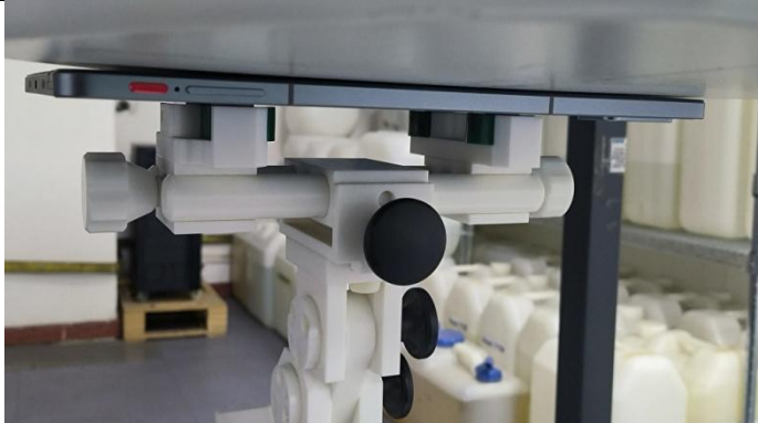
Front Side (Separation distance of 0mm)