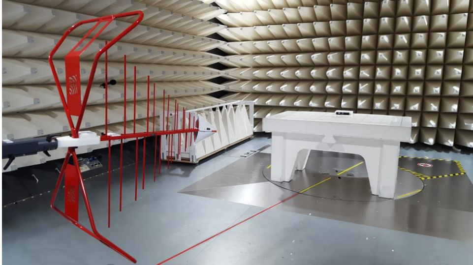
Figure B3. Low Range Radiated Emission Set up