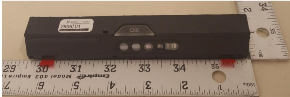
Figure B1. DUT top view