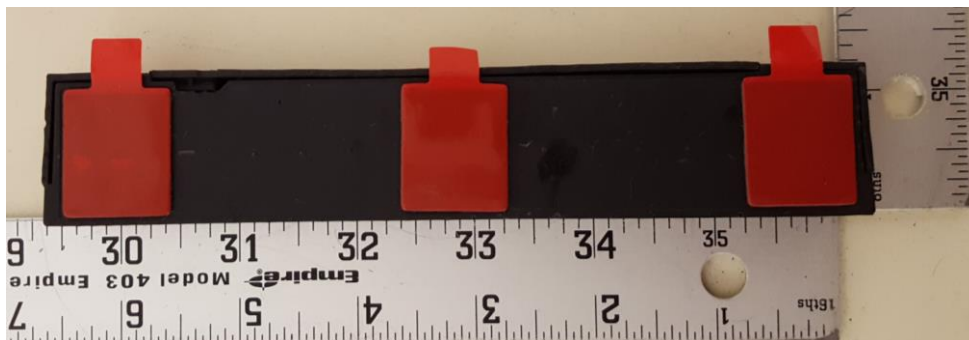
Figure B2. DUT rear view