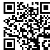
MOGO APP QR Code