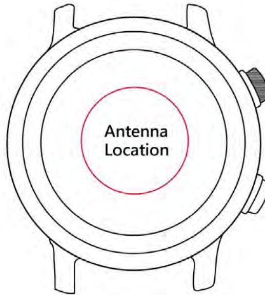
Fig.7 Antenna location (front view)