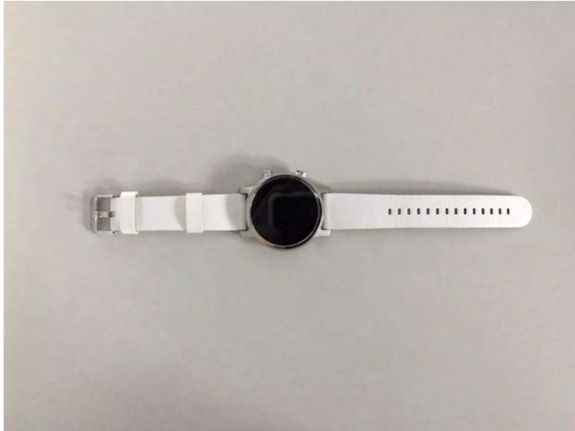
Fig.5 Front view of EUT