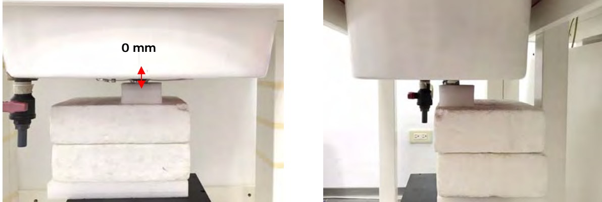
Fig.3 Back side of EUT to flat phantom