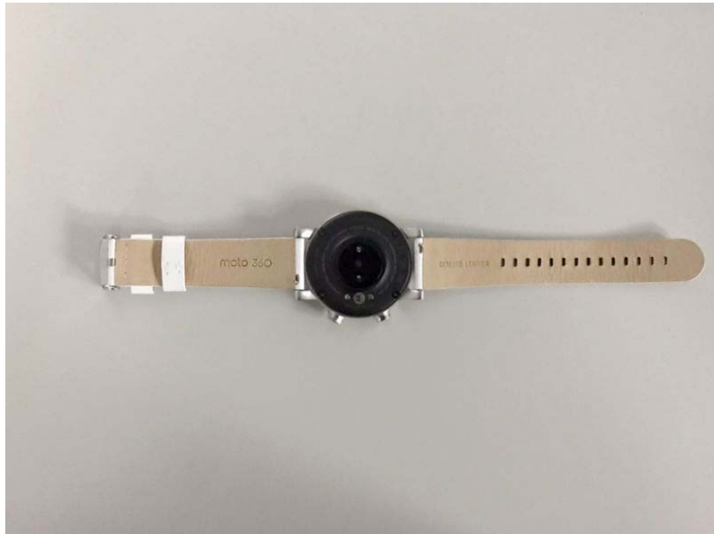
Fig.6 Back view of EUT

Unless otherwise stated the results shown in this test report refer only to the sample(s) tested and such sample(s) are retained for 90 days only. 除非另有說明，此報告結果僅對測試之樣品負責，同時此樣品僅保留90天。本報告未經本公司書面許可，不可部份複製。