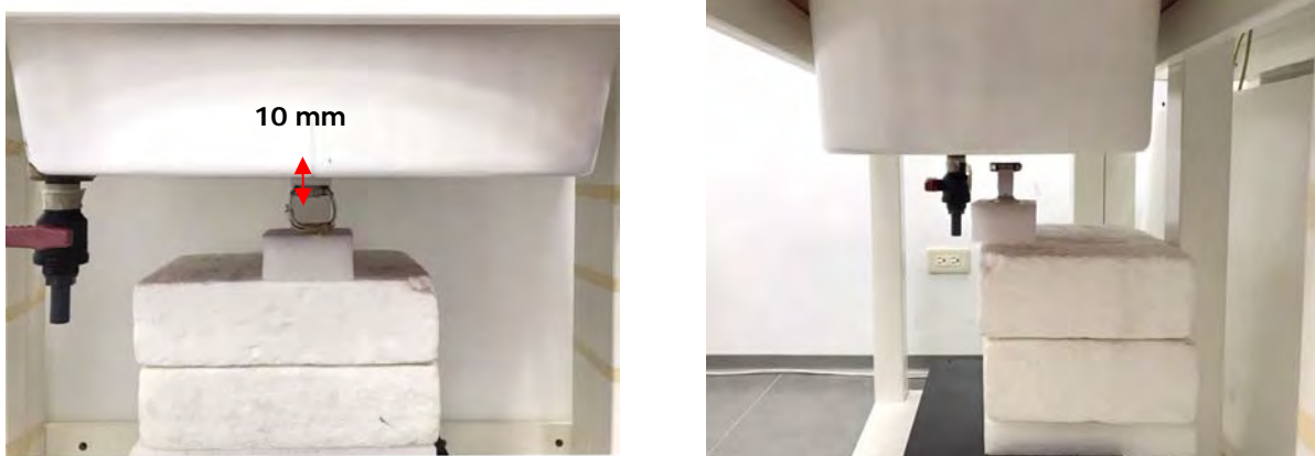
Fig.4 Front side of EUT to flat phantom

Unless otherwise stated the results shown in this test report refer only to the sample(s) tested and such sample(s) are retained for 90 days only.