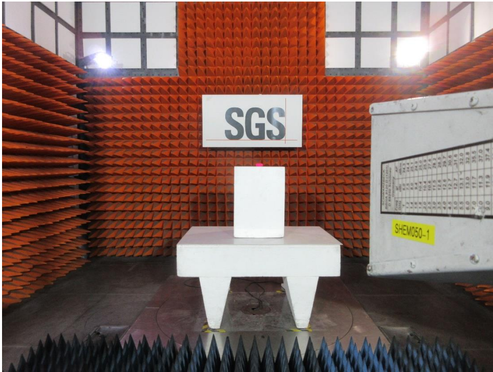
The EUT Details of Zoom