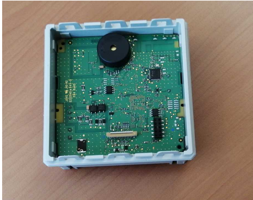
Photo 3 - PCB front view