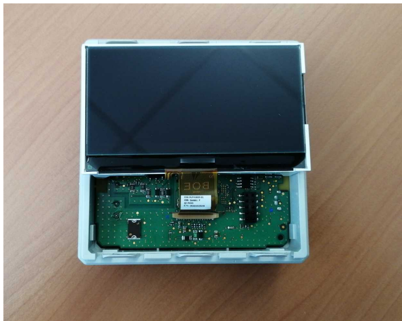
Photo 4 - DUT with unmounted front cover