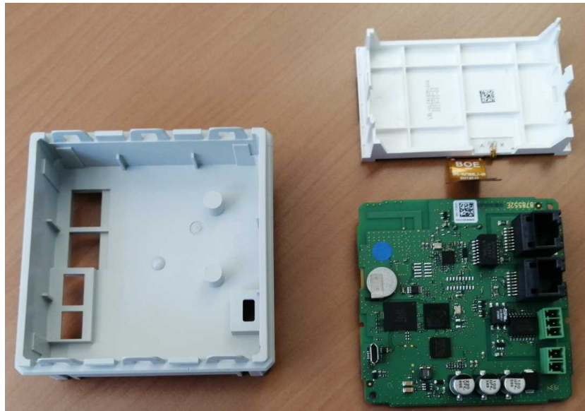
Photo 1 - unmounted PCB