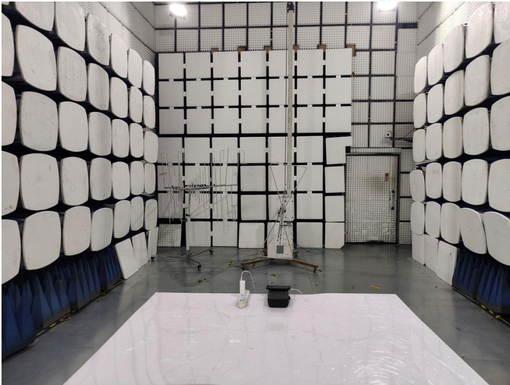
Radiated Emission below 1GHz-AC adapter charge mode