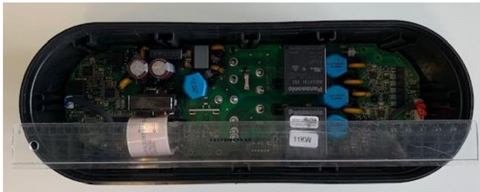
Top view PWR-Board: Model IC-CPD