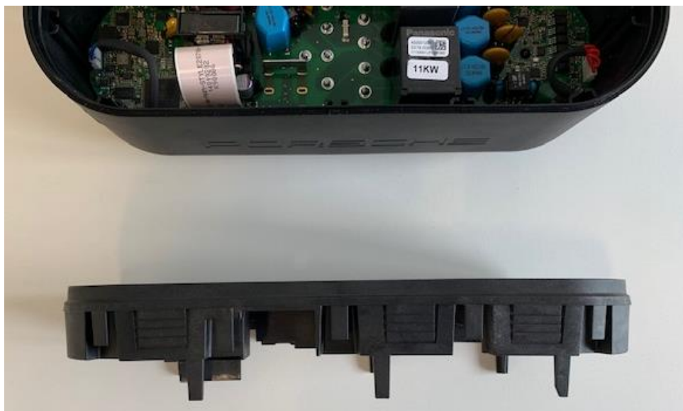
Side view holding frame: Model IC-CPD