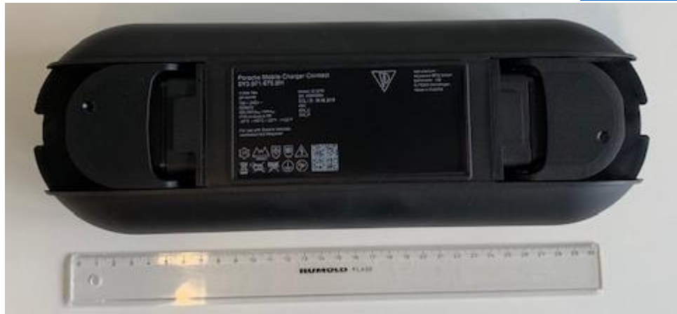
Back view: Model IC-CPD, (with marking label e.g. Porsche)