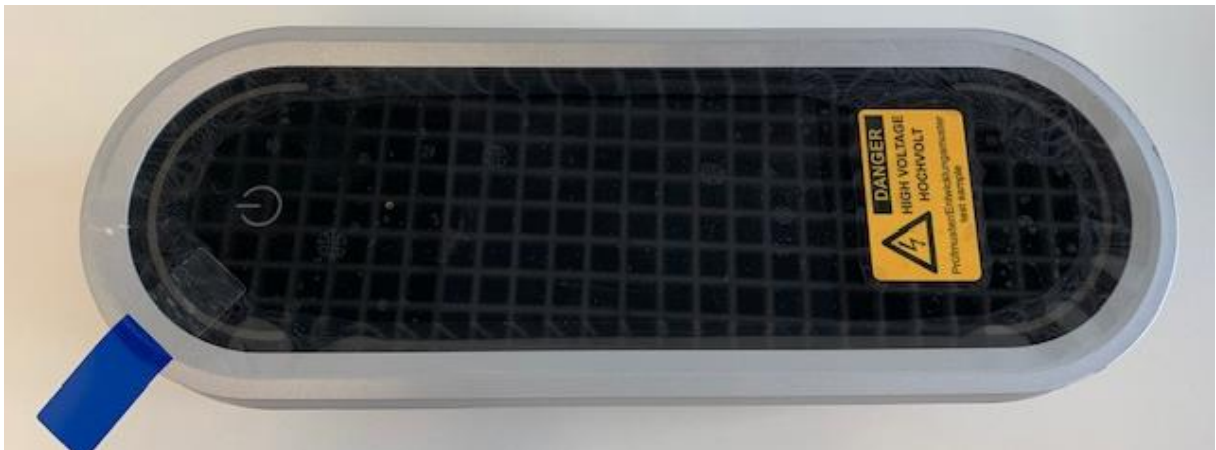
Front view: Model IC-CPD

Factory: Made in Czechia, K Prádlu 858/1, 73535 Horní Suchá