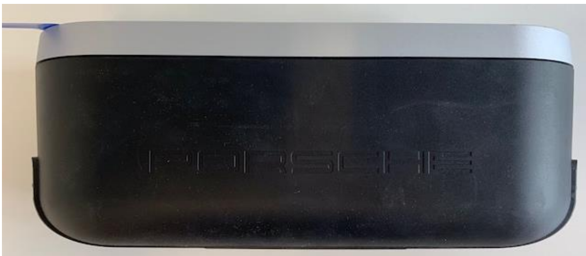
Side view: Model IC-CPD (sample Porsche)