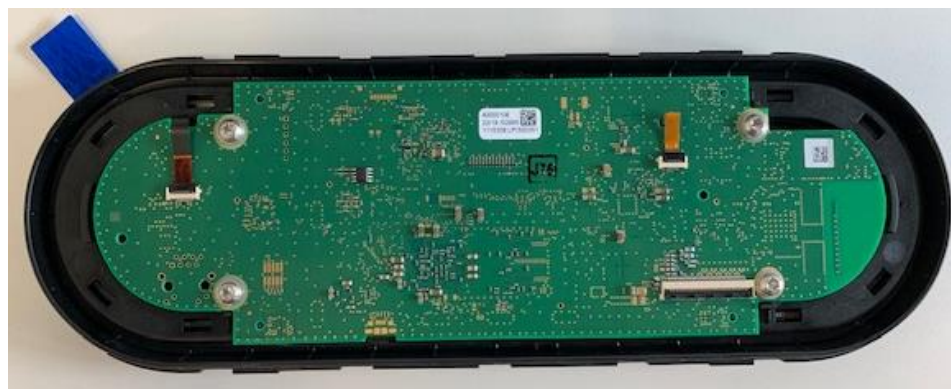
Top view COM-Board: Model IC-CPD