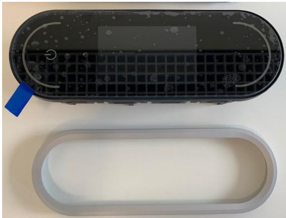
Top view: Model IC-CPD (with decorative frame, demounted)